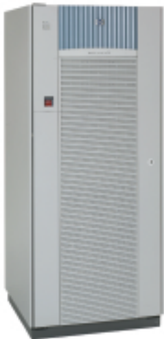
hp StorageWorks xp128 disk array