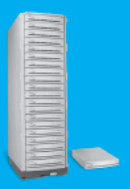
The new A-Class servers from HP: Enabling your business to scale new heights.

HP's new A-Class servers are uniquely designed to meet the needs of Internet-Age businesses like yours. They allow you to blaze new trails at incredible speeds, quickly shift gears as business conditions change, without any compromise in customer service, and without breaking the bank. Power Packed. Street Smart. The answer you've been looking for.