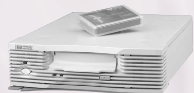
Rack-Ready DDS-4 Tape Drive